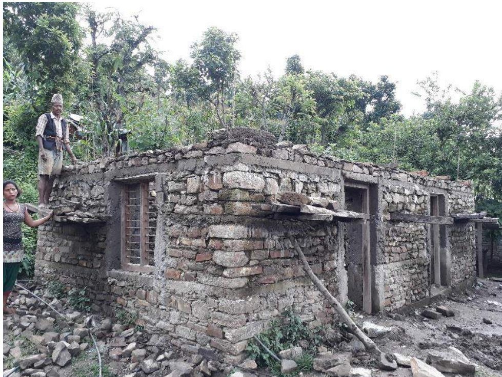
Stone masonry, Masel, Gorkha