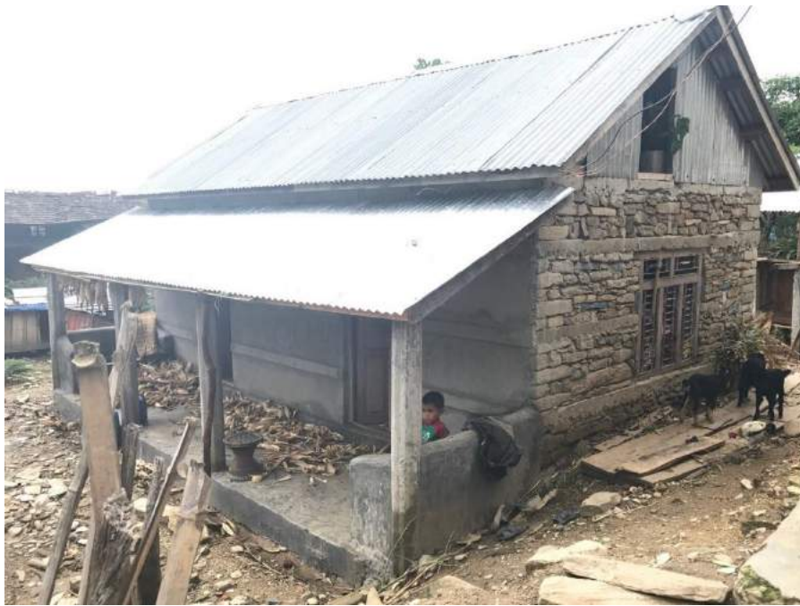
Newly constructed home in Arupokhari replicating demonstration house earthquake resilience elements.

NSET-Baliyo Ghar Programme Update: the 51 st mason training under Baliyo Ghar was completed in Dolakha on 4 August. To date, over 4,500 masons have been trained across Dolakha, Nuwakot, and Dhading through the Baliyo Ghar programme. A three day social mobiliser training for technical professionals was also completed this week in Singati, Dolakha. The training focused on the concepts of social development, social mobilisation and the reconstruction work-cycle, sustainable development, participatory approaches, GESI and reconstruction, and the housing reconstruction process. This week the Baliyo Ghar TV programme will focus on the reconstruction status in different areas of Dhading and the Baliyo Ghar radio programme will focus on 'On the Job' Training.