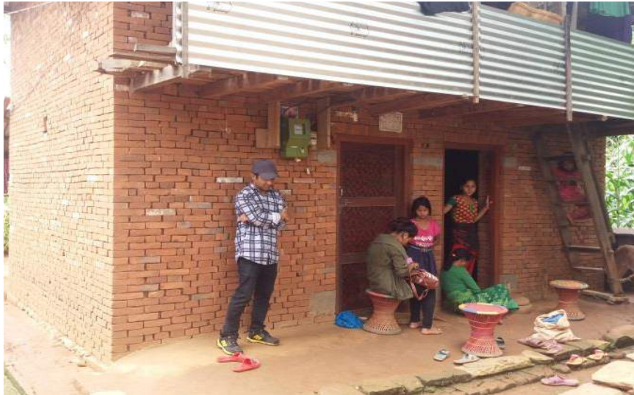
Load Bearing Structure, Salyantar, Dhading