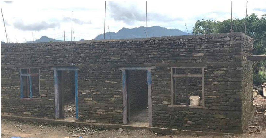
Newly constructed home in Arupokhari replicating demonstration house earthquake resilience elements.

Demonstration Houses, Arupokhari, Gorkha: as part of CRS Nepal's reconstruction and recovery programme a demonstration house has been constructed in each of the wards in Arupokhari VDC. CRS Nepal have found that 70% of households have replicated the demonstration houses when constructing their own homes which therefore now include earthquake resilient measures and meet compliance requirements.