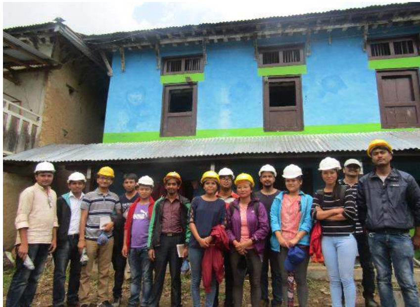
Engineers being trained on retrofit type design, in front of a retrofitted house in Bethanchok during a practical session.

Demonstration Houses, Arupokhari, Gorkha: as part of CRS Nepal's reconstruction and recovery programme a demonstration house has been constructed in each of the wards in Arupokhari VDC. CRS Nepal have found that 70% of households have replicated the demonstration houses when constructing their own homes which therefore now include earthquake resilient measures and meet compliance requirements.