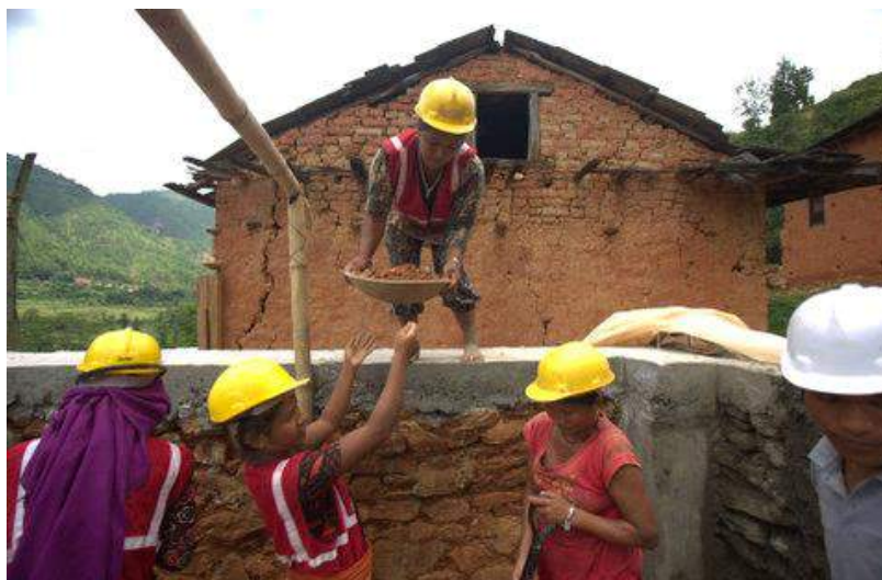
Homeowners, men and women, busy at work as they retrofit their houses in Sangachok.

DFID Springboard Retrofitting Project Update: First SMM type design approved by NRA Technical Committee and MoUD CLPIU. Work on customisation rules for expanded application ongoing. Type design development progressing for both dry stone and adobe typologies, both with heavyweight and lightweight options. Current phase of retrofitting has commenced and initial examples of homeowner, entrepreneur and NGO take up models being trialled. Technical assistance agreements established with Helvetas, WVIN, Oxfam and more pending. First 7-day engineering training held with 15 DUDBC engineers (32 total trainees) trialling updated curriculum and step-by-step pictorial construction guide. Participant selection in progress for pilot OJT mason training. Upon request of CLPIU, half-day orientation training on approved type design being delivered to over 2000 DUDBC engineers and technical staff across 14 most earthquake affected districts in progress, over 1600 trained to date, to be completed mid-August. For more information on the Springboard Project please contact Sandeep Man Shakya, Project Manager, Build Change, sandeep@buildchange.org .