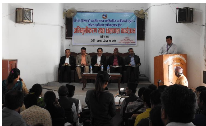
Orientation and discussion between the newly elected local representatives and National Reconstruction Authority, Gorkha, 2 June 2017.